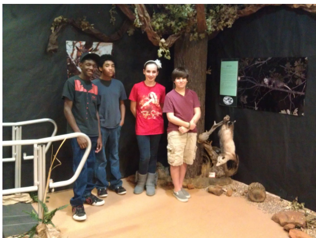
Students from Clariden School will be volunteering at the Nature Center & Preserve during the Spring semester.